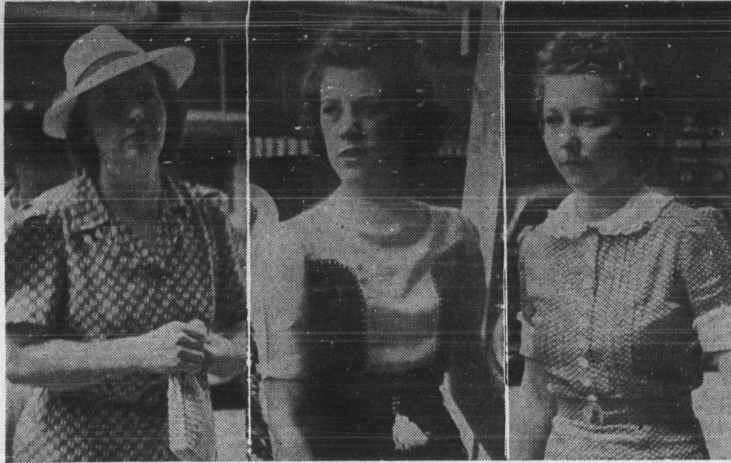
Pictured above are three people to whom will be given two free theatre tickets, if they will kindly call at The Tribune in person. These free tickets are good for admission to either the Elk or Lyric theatre. Next week three more people will be pictured in this space. Watch The Tribune—maybe your picture will appear.