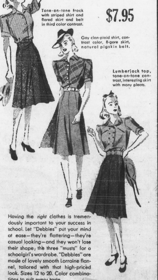
Tone-on-tone frock with striped shirt and flared skirt and belt in third color contrast. $7.95

Classic fashions for wear in or out of the classroom