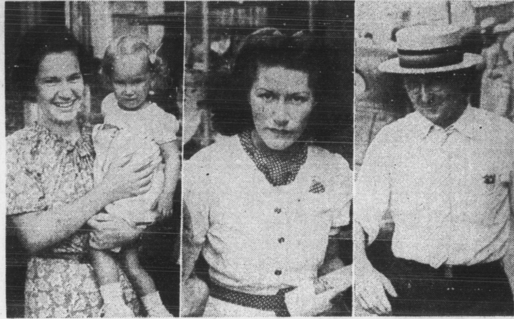
The three pictured above will be given two free theatre tickets each good for admission to the Lyric or Elk theatres if they will call at The Tribune. Next week other pictures made by The Tribune cameraman will appear in this space and more free tickets will be given away. Watch these pictures weekly. Maybe you will see yourself.