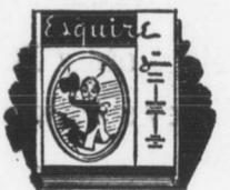
Figure C Esquire Coronet Inc.