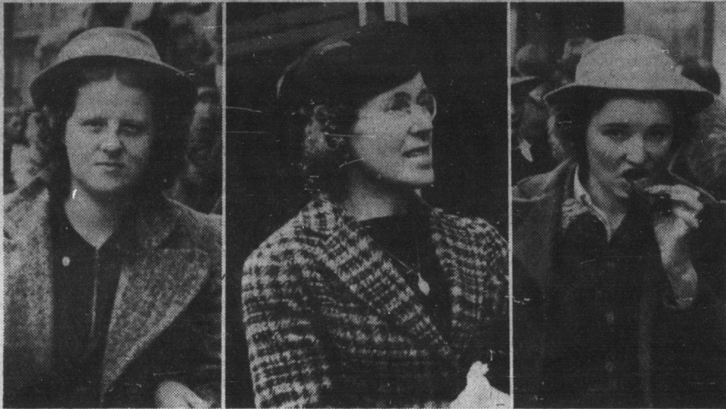
Last week this picture was crowded out for lack of space and we were questioned by several persons as to the reason why. We appreciate this interest and will be pleased to present two tickets each to the Lyric or Elk theatres if those pictured above will call at The Tribune office in person. Three more pictures will appear next week.