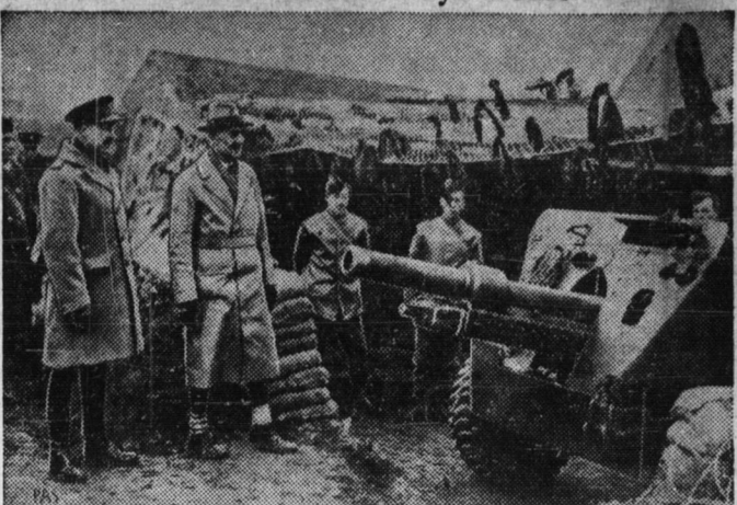
ON THE BRITISH FRONT—Prime Minister Neville Chamberlain (second from left), inspecting a gun in a camouflaged emplacement during his recent visit to the British war zone in France. This photo was passed by the British censor.