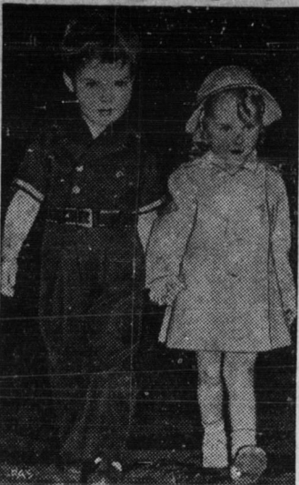
NEW YORK, N. Y. . . . A three piece cape suit in soldier blue with red lining and a duo-tone three piece flannel ensemble in two tones of rose, seen at the Parents' Magazine's children's Spring fashion show at the Hotel New Yorker.