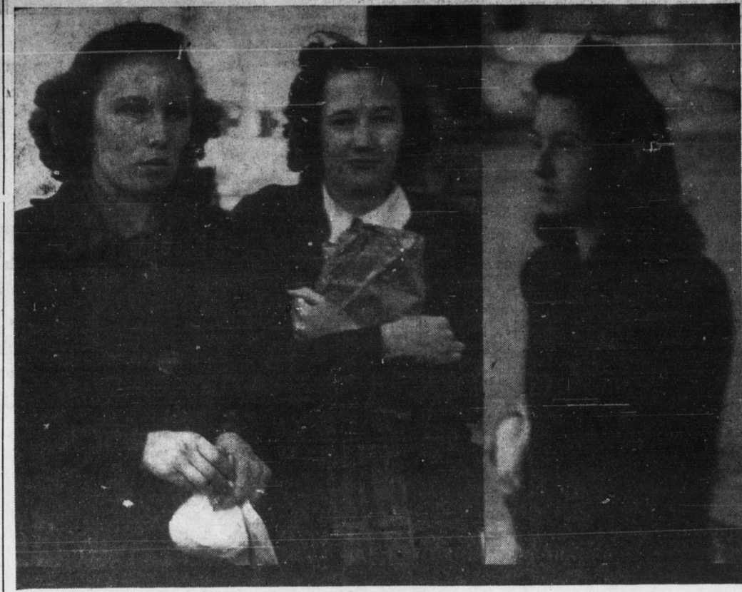
Two free theatre tickets, good for admission to both the Lyric and Elk Theatres, will be given each of the three people pictured above if they will call at The Tribune. Next week there will be three more pictures published, all taken on Elkin streets by The Tribune photographer.

Free Theatre Tickets to Be Given Those Pictured