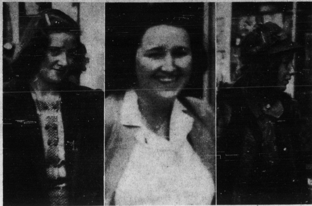
The three pictured above will be given two free theatre tickets, good for admission to the Elk or Lyric theatres, if they will call in person at The Tribune office. These tickets are good for any show with the exception of "Gone With the Wind," which plays at the Lyric three days beginning Monday.

country, willing to give their lives in its defense, if necessary. We can be thankful today that we had such men twenty-two years ago. From them we can draw inspiration for the patriotic service necessary to maintain our freedom and democracy against today's dangers. Wearing their flower over our hearts means that within our hearts their love of America still lives."