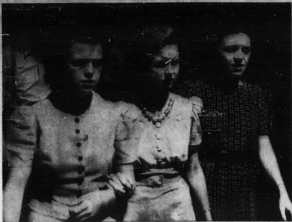
The three young ladies pictured above have two free theatre tickets awaiting each if they will call in person at The Tribune. Tickets are good to Lyric and Elk theatres. Next week watch for more pictures made on the street by The Tribune photographer. Everyone who is pictured in this space gets free tickets.