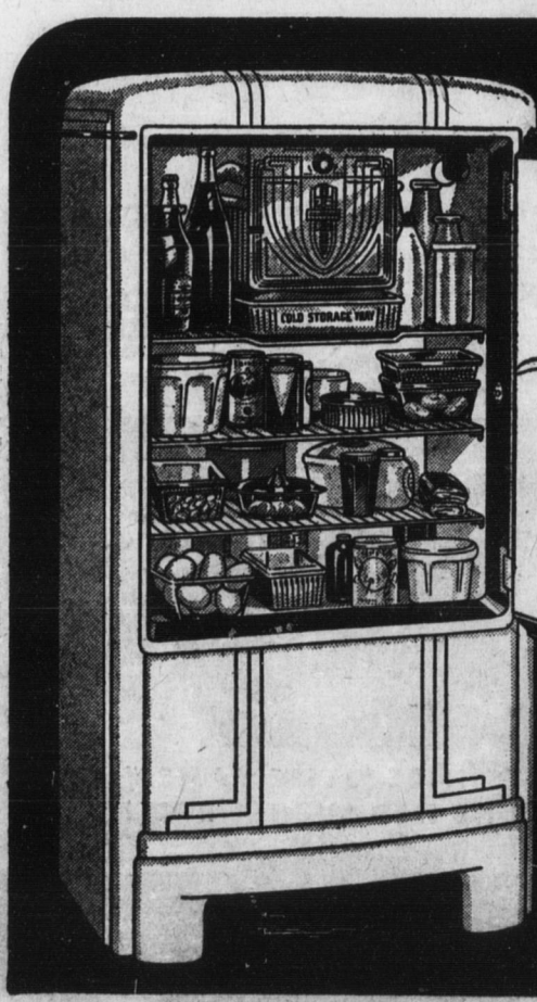
Model SVS 6-40 Now Going On! Our Frigidaire PROOF-OF-VALUE DEMONSTRATION

LOWEST PRICE IN HISTORY! ONLY $114.75 Easy Terms Brand New 6 Cu. Ft. 1940 Model Never before a "buy" like this! Has many of the same finest construction features as most expensive models. Same Meter-Miser mechanism... 1-Piece Steel Cabinet! Sensational low price includes 5-Year Protection Plan against service expense on entire sealed-in mechanism. The refrigerator bargain of the year!