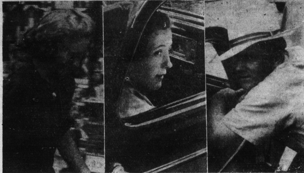
It's hard to get away from the lens of The Tribune candid cameraman when he sets out to make free ticket photos on Elkin streets. As a result, the three people pictured above have two free theatre tickets each awaiting at The Tribune office if they will call in person and ask for them.