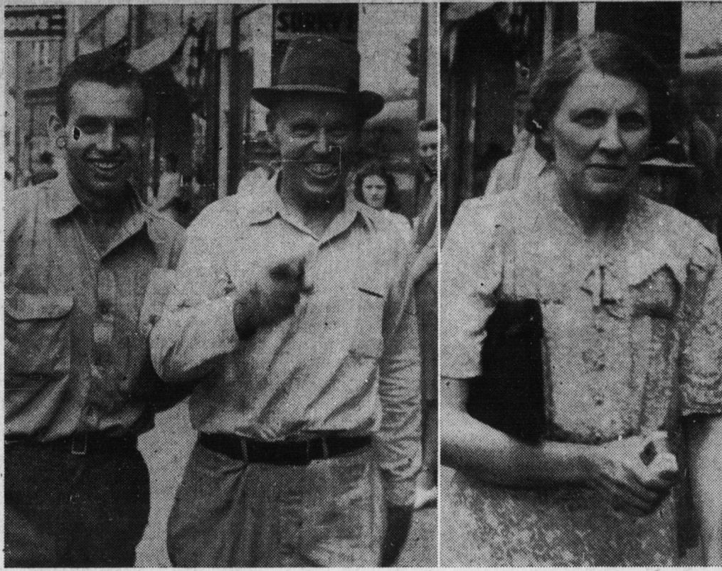
The Tribune cameraman has been at it again, and thanks to his lens, the three Elkin people pictured above will be given two free theatre tickets each if they will kindly call at The Tribune office in person and ask for them. Tickets are good for admission to both the Elk and Lyric theatres.