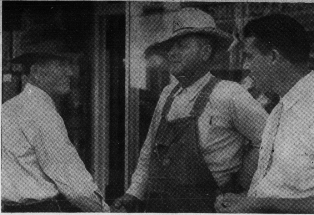
These three men will be given two free theatre tickets each, good for admission to the Elk or Lyric theatre if they will call at The Tribune office.