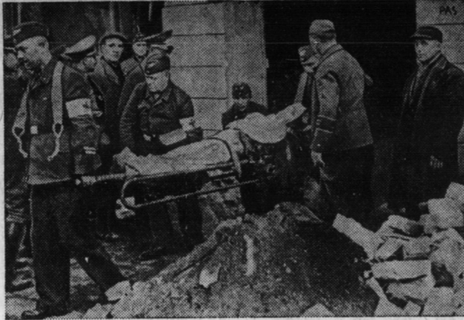
BERLIN, Germany . . . In the present retaliatory war tactics, both Berlin and London are receiving their share of aerial bombardment. Here, after a night raid on Northwest Berlin, a victim is removed from a bomb-shattered building.