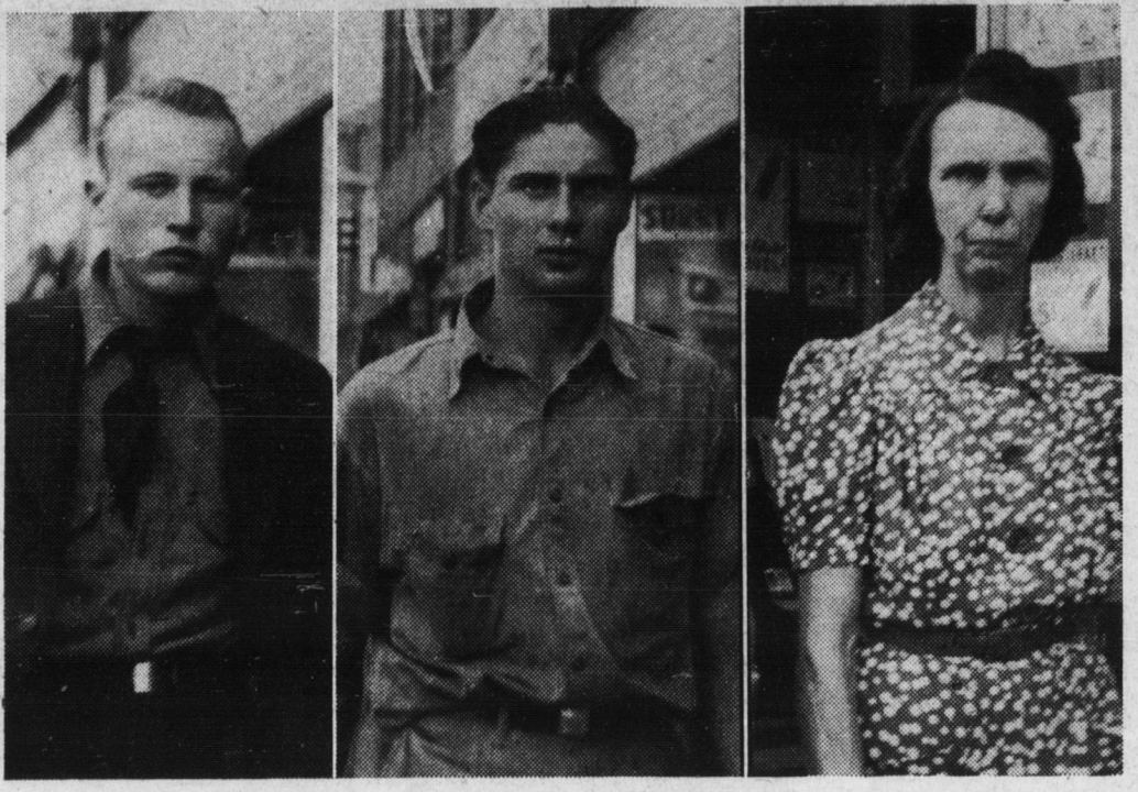
The three people pictured below will be given two free theatre tickets each, good for admission to the Elk or Lyric theatres if they will call in person at The Tribune. These photos were snapped on Main street. Watch for more pictures next week.—(Tribune Photos.)

we inventory briefly the productivity of this nation in farm, field and factory, and then add to it the whole construction field and all those who labor in business establishments, schoolrooms and colleges, offices, laboratories and in all fields of science and research. They are all workers. The professional men are many times the hardest workers with longer hours than any of the others. This nation is composed of a busy line of laborers, with comparatively few drones. There is not much place for an idler in our whole economy, unless made so by age, health or some disability."