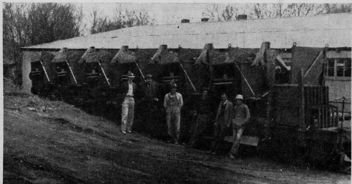
Carload of Allis-Chalmers Combines Delivered Last Week

Farmers of This Section Depend On Us For . . .