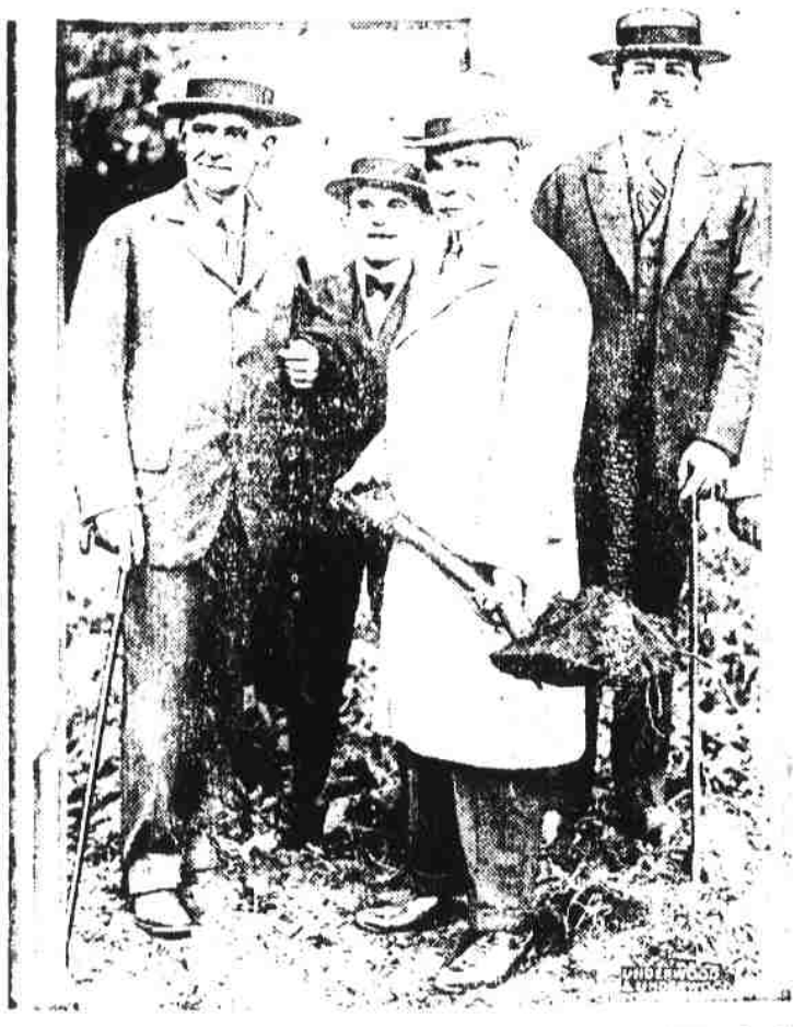
posturities to be the second of the of Operation Arts at Story, itself at the Hitchen.