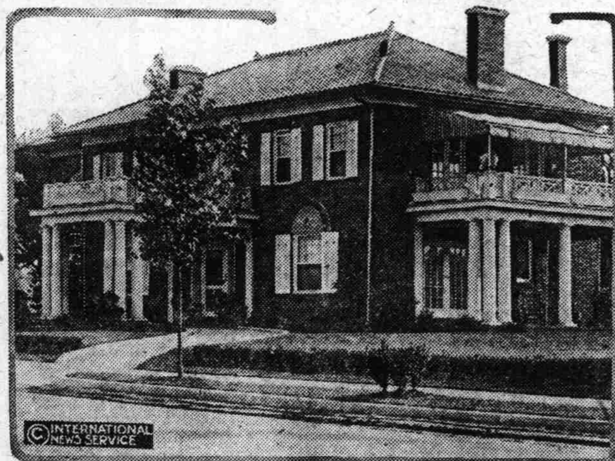
This is the residence at Forest Hills, Long Island, which Gen. Victoriano Huerta has leased and in which he has installed his wife and their household of 30 children, grandchildren, tutors and servants.

Safety Matches Running Short. According to a Melbourne dispatch to the Sydney (Australia) Herald, reprinted in a commercial report, strict economy in the use of safety matches is being advocated by merchants who know how limited the stocks in Australia are at present, and how difficult it is to procure further supplies while the war lasts. Already prices have risen 133 per cent in the wholesale market, and only a most careful use of these matches can prevent an actual shortage. The chief reason for this state of affairs