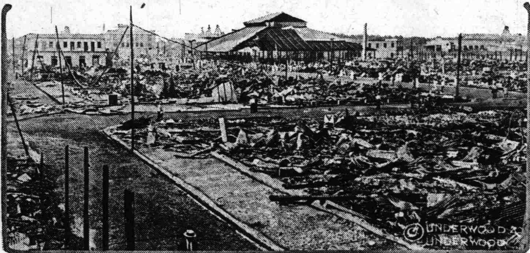
More than half of the city of Colon, Panama, was destroyed by the recent great conflagration. The photograph gives a view of the ruins from Bolivar street, looking toward Cristobal. The ruins of the market are seen in the background.