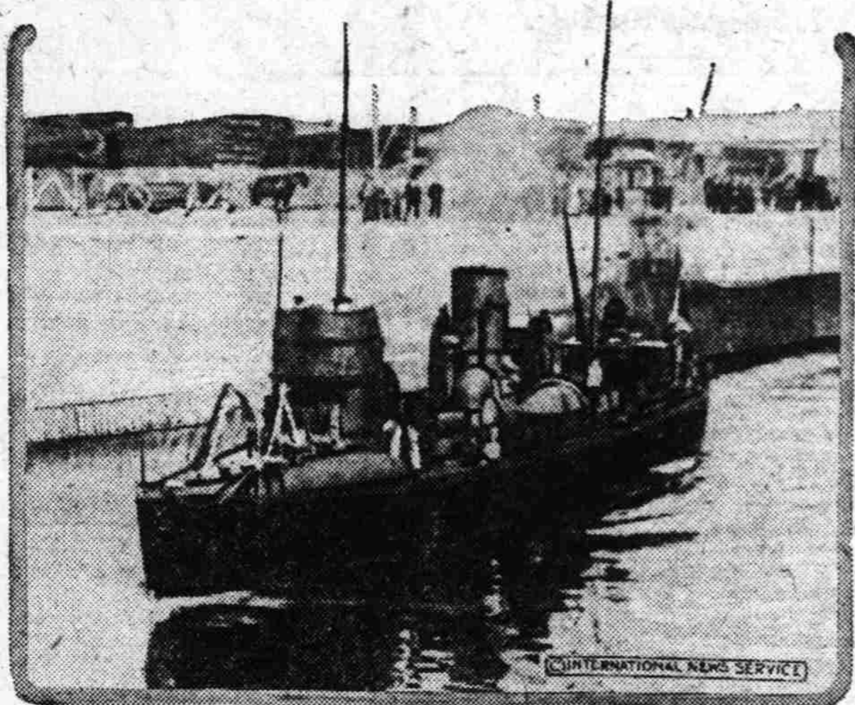
This photograph of a German destroyer passing through the docks of Antwerp was taken secretly by a resident of that city, despite the German threat of fine and imprisonment for anyone taking photographs. It would seem to indicate that Holland's neutrality has been violated.