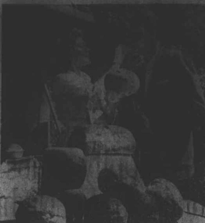
Freshly-baked bread from an outdoor bake oven on the Gaspe Peninsula of La Province de Quebec, tastes mighty good. Outdoor bake ovens are common sights in the hillside villages of the Gaspé region. Regular tours are operated by the Canadian National from Montreal to Gaspé, and around the Gaspe Peninsula by motor car.