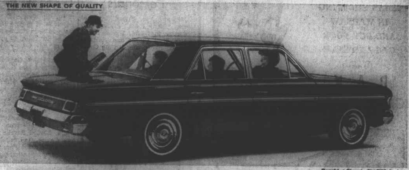
THE NEW SHAPE OF QUALITY Rambler Classic Six 770 Sedan

maiden name, an application should be made to have it changed. Any person who cannot locate his or her card, should apply for a new one right away. Many employers will not put a worker on the job until he has the worker's social security number. The competition for Christmas jobs is always hectic, and having your card available will make finding money-producing Christmas employment easier. Anyone who has any questions concerning social security account number cards, is advised to contact the District Office at 311 East Walnut Street in Goldsboro. Office hours are 8:45 a. m. to 5:00 p. m., and the telephone number is 735-15-