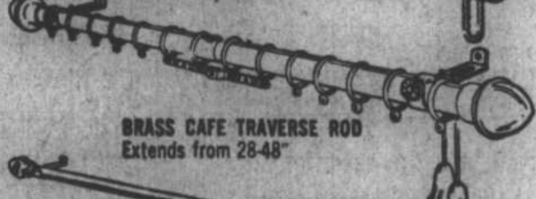
BRASS CAFE TRAVERSE ROD Extends from 28-48"