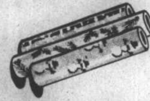
Christmas gift wrapping

Discount Given On Balance Due On All Lay-Aways That Are Paid For And Picked Up During Sale