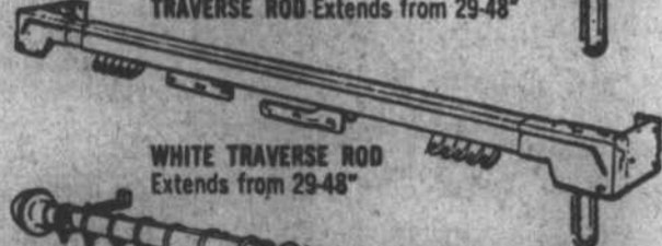
WHITE TRAVERSE ROD Extends from 29-48"