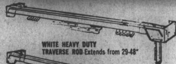
WHITE HEAVY DUTY TRAVERSE ROD Extends from 29-48"

STANLEY TRAVERSE RODS • CAFE RODS CURTAIN RODS and ACCESSORIES