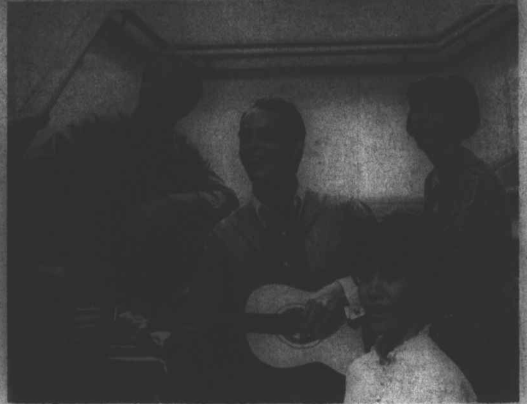
The Kaleidoscope Players