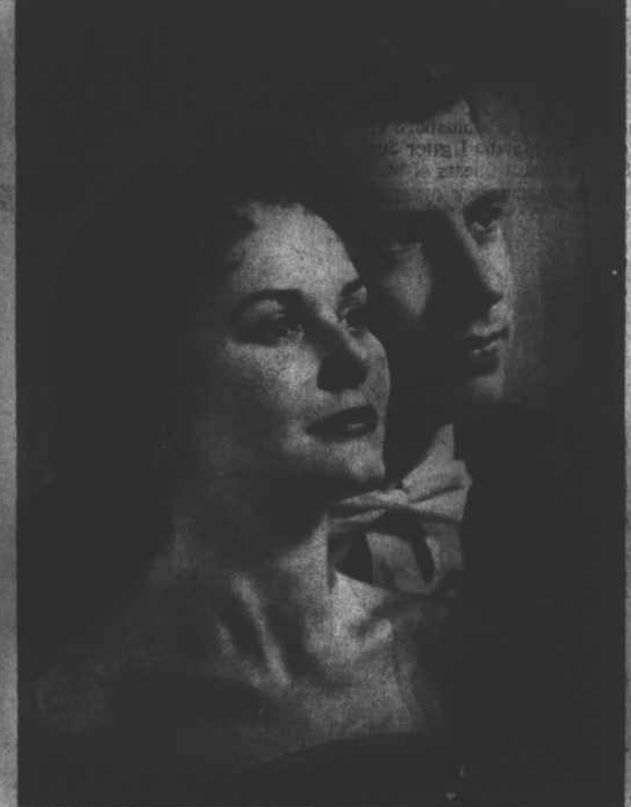
The Lucktenberg Duo