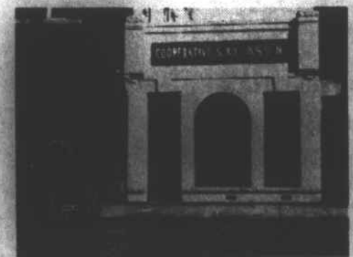
Interior and exterior photos taken 1932.

We feel that this growth is a real indication of the confidence the people of this area have in Cooperative Savings and Loan.