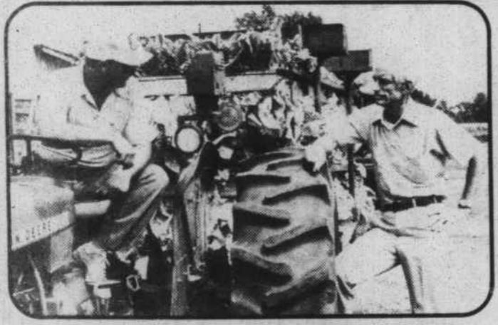
Paid Political Advertisement

SALE SITE: Take R.R. 1368 at Beautancus to Rones Chapel, go 1 mile, Look for Auction Signs Personal property and Farm Tools (2) 4-HP Gas Motors Kenmore Dryer & Washer Wood Heater Frigidaire Refrigerator App. 3 - 6,000 tobacco sticks (2) Televisions Small Farm Trailer Gas Stove Pig Feeders Vacuum Cleaner 4-HP Water Pump Tables & Lamps Pull-type Lawn Mower Dinette Suite Chains Den furniture Hand Tools Frigidaire Stove Wrenches Beds Lumber Bedroom Furniture Drill & Sander Stereo & Radio Many Other Items too numerous to mention. Al Whitfield Auctioneer Goldsboro, N.C. 27530 Ph. 734-8038 N.C.A.L. 533