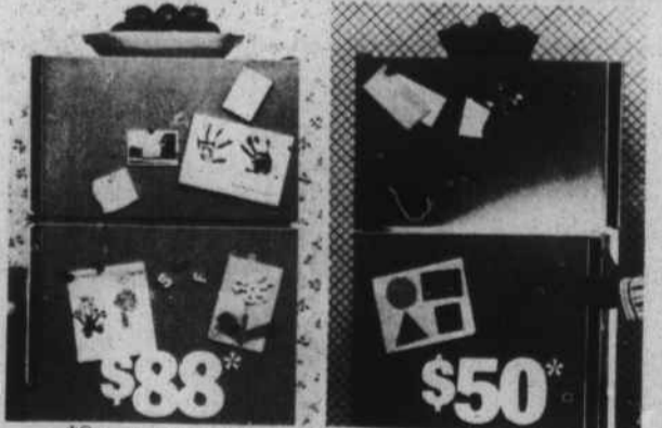
*One may cost more to buy but CPY can make up the difference fast

When the EPA started MPG ratings, car-buyers got a new way to evaluate cars. Now the same idea has been put to work in appliances by the U.S. Department of Energy. It's called "Energy Guide Labeling," and it can make a big difference in the cost of keeping your appliances running. For example, there can be a $38 difference in the Energy CPY (Cost Per Year) of refrigerator/freezers the same size. Of course, costs and savings may vary, but the idea is to get the best deal you can on energy. So look for the label when you shop. Or just ask us for the details. Because the more you get out of your energy dollars, the more we can get out of ours. And the less your bills will have to go up later on.