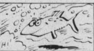
Fish have been seen at ocean depths of almost 7 miles.