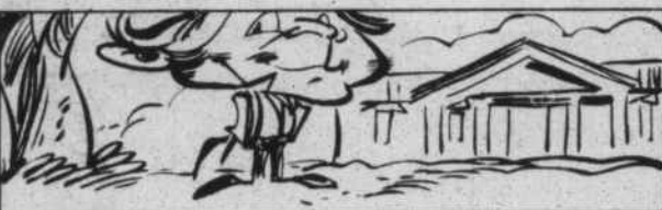
James Madison was the shortest of all America's Presidents, standing only five feet, four inches tall.