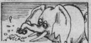
An adult African elephant needs 300 to 400 pounds of fodder every day.