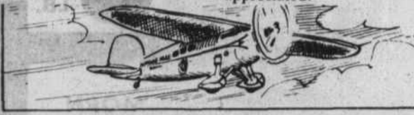
Flying in his plane, the Winnie Mae, Wiley Post completed the first round-the-world solo flight in 1933.

All support will be greatly appreciated.