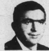
Ethro Hill Highway #11 Pink Hill 568-3310