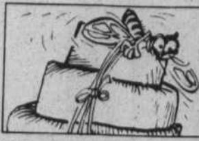
A honeybee can carry a burden 300 times its own weight.