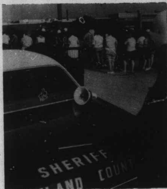
Disruption In The Schools