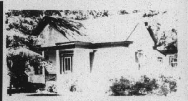
NEW LISTING - Hill St., Warsaw - 3 BR, 2 Baths, Completely redone. Excellent Condition. Must See This One