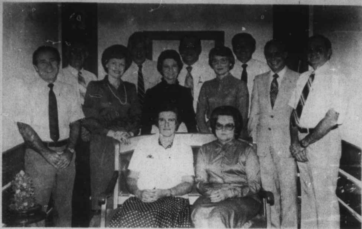
KENANSVILLE HIGH SCHOOL CLASS OF 1963 - Members of the 1963 graduating class of Kenansville High School, some former classmates and families met at the Rose Hill Restaurant in Rose Hill Sept. 24 for their annual reunion. Pictured above are the class members.