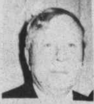
Ethro-Hill Highway #11 Pink Hill 568-3310

NATIONWIDE INSURANCE Nationwide is on your side