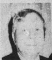
Ethro Hill Highway #11 Pink Hill 568-3310