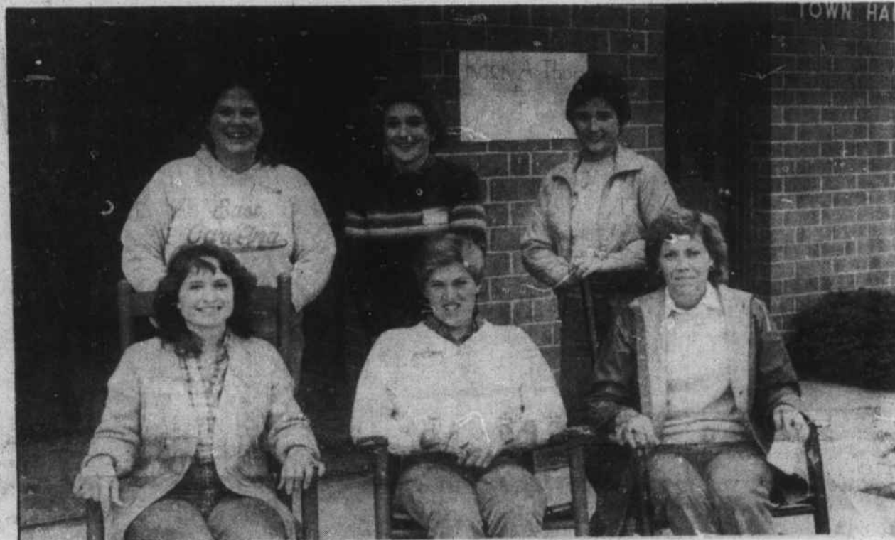
CYSTIC FIBROSIS ROCK-A-THON - The Kenansville Jaycettes held a Rock-A-Thon on Saturday, Oct. 22, at the Kenansville Fire Department with all proceeds going to the Cystic Fibrosis Foundation. Workers pictured, left to