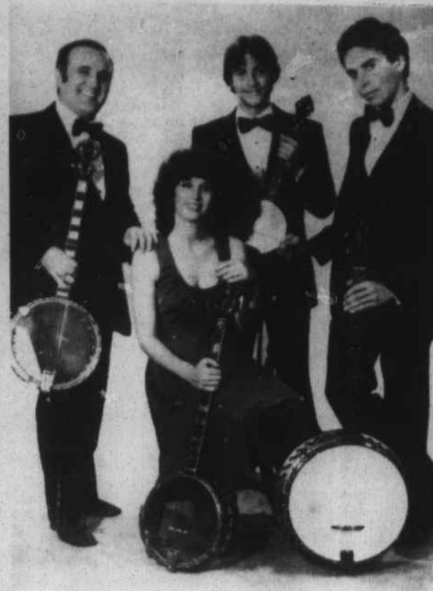
The New York Banjo Ensemble

A limited number of season tickets will be available at the door priced at $12.50 for adults and $5 for students. Plan now to experience America's musical heritage with The New York Banjo Ensemble.