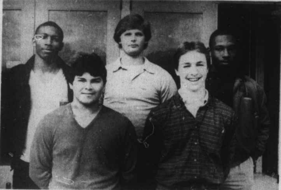
BULLDOG PLAYERS SELECTED HONORABLE MENTION - Finishing the season with one conference loss and second place, five members of the Wallace-Rose Hill Bulldogs football players were selected East Central Division 2-A Honorable Mention.

gest income tax service, has more than 9,000 offices worldwide.