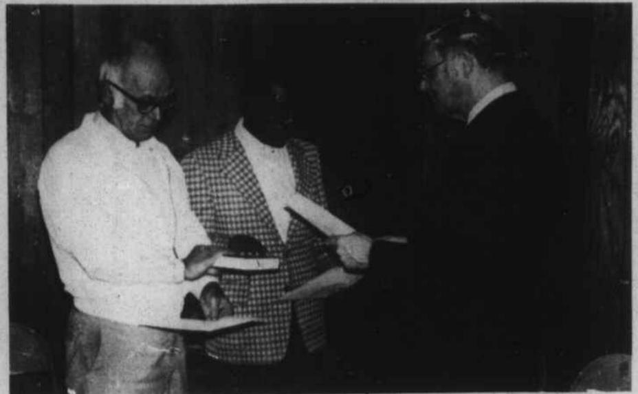
Magnolia Board Members Take Oath Of Office