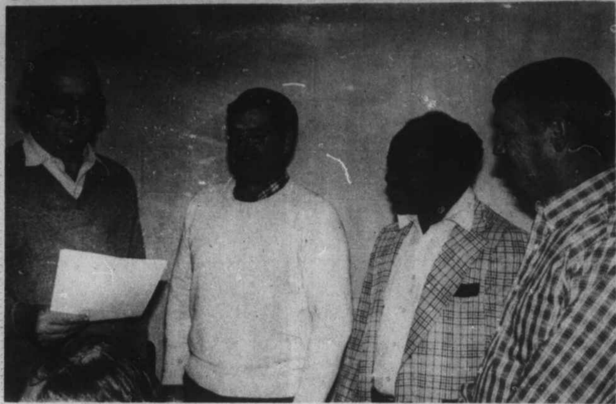
Three Sworn In As Warsaw Town Commissioners