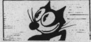
The first image transmitted on experimental television in the 1920s was that of the cartoon character, Felix the Cat.

said. The convenience clinic will be operated by a physician and appointments will not be necessary. The clinic is intended to provide treatment for one-time injuries or illnesses. Long-term treatments for illnesses will be referred to private physicians," he added. Further details about the convenience clinic are expected to be released in mid-January, and if plans are developed as expected the new service should begin in February.