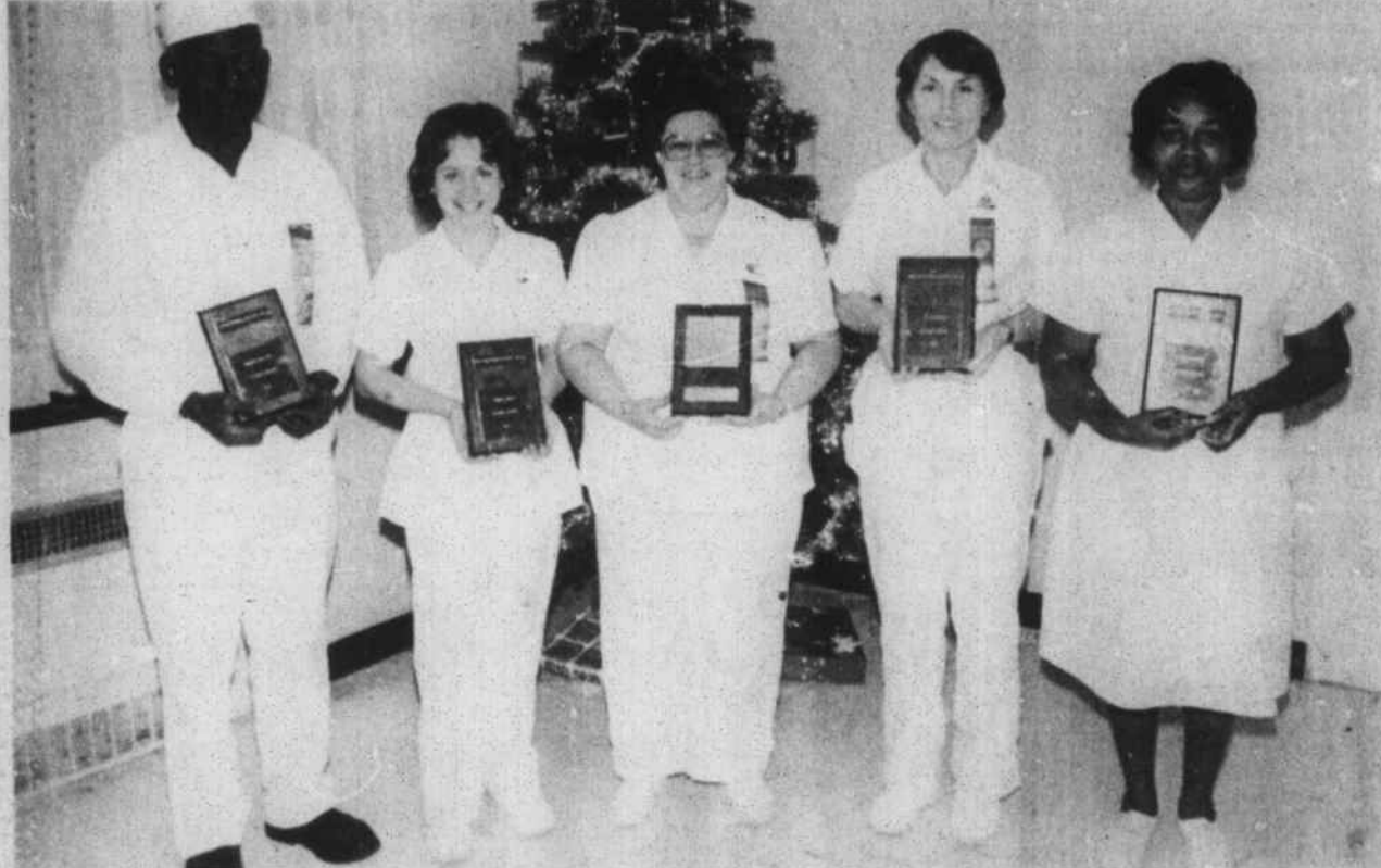
SERVICE AWARDS PRESENTED DGH EMPLOYEES - Six nursing service employees at Duplin General Hospital were recently presented special recognition for 15 years of continuous full-time employment. Pictured, left to right,