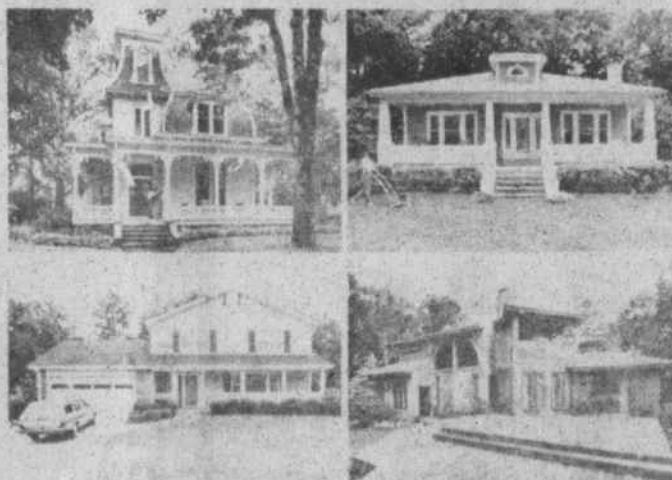
Savings based on houses with 1,500 square feet. Bigger houses save more.

YOU CAN SAVE $250* ON HEATING AND COOLING YOUR HOME. ALL IT TAKES IS COMMON SENSE.