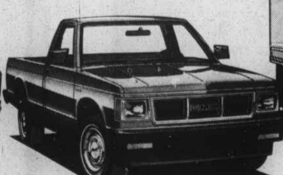
GMC S-15 Pickup