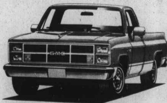
GMC Full-size Pickup