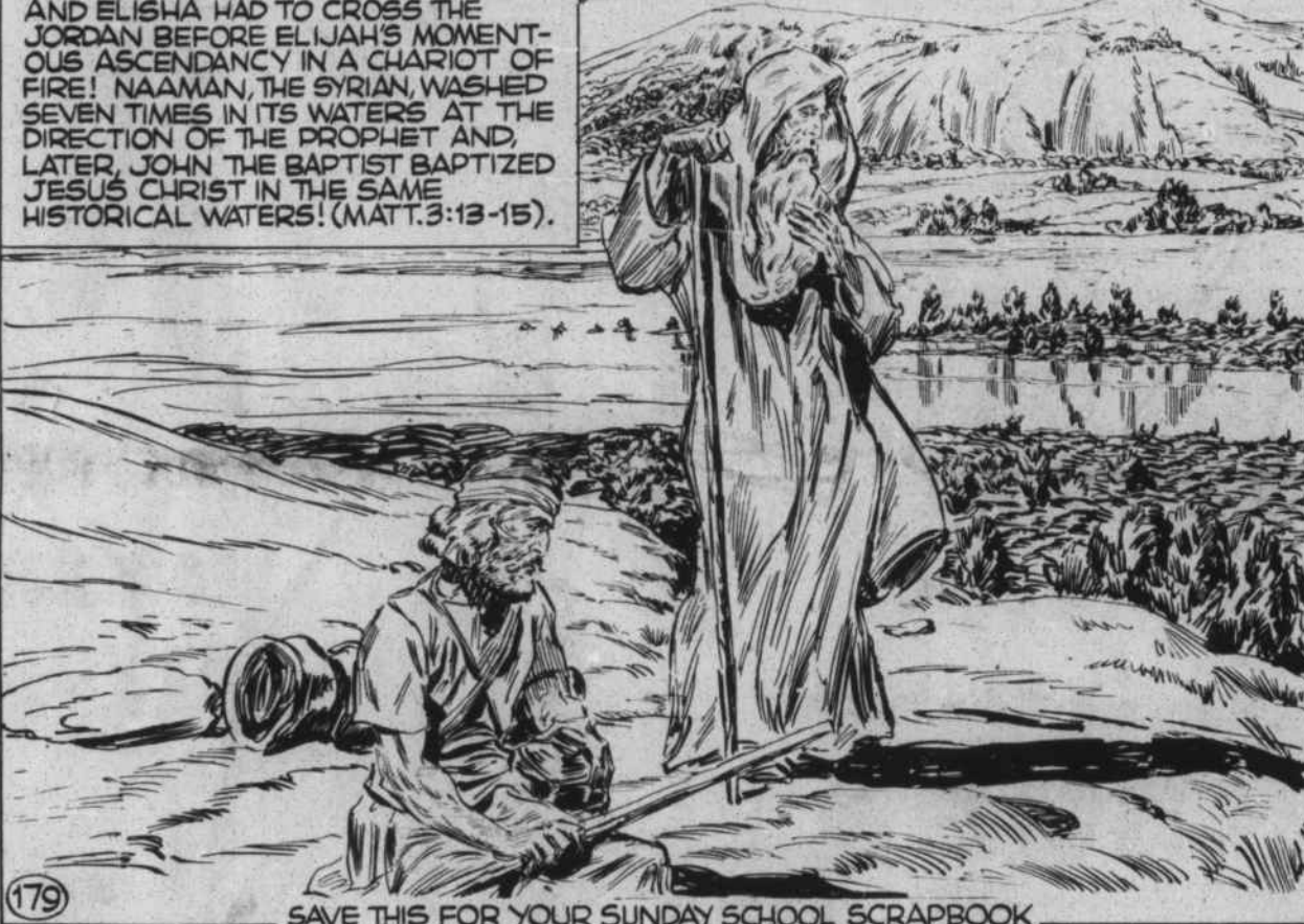
SAVE THIS FOR YOUR SUNDAY SCHOOL SCRAPBOOK

THE JORDAN IS THE MOST IMPORTANT RIVER IN PALESTINE AND, HISTORICALLY, OF GREAT IMPORTANCE IN THE RELIGIONS OF JUDAISM AND CHRISTIANITY. ITS LENGTH IS LISTED AS ONE HUNDRED AND FOUR MILES BUT, BECAUSE OF ITS TORTUOUS WINDINGS, THE RIVER TRAVERSES AT LEAST TWO HUNDRED MILES BEFORE ENDING UP IN THE DEAD SEA! IT ALSO STANDS ALONE, AMONG THE RIVERS OF THE WORLD, DUE TO THE FACT THAT THE GREATER PART OF ITS COURSE RUNS BELOW THE LEVEL OF THE OCEAN! AT ITS START, THE JORDAN IS ONE THOUSAND FEET ABOVE THE LEVEL OF THE MEDITERRANEAN, BUT BY THE TIME IT ENTERS THE DEAD SEA, IT IS ONE THOUSAND TWO HUNDRED AND NINETY FEET BELOW SEA LEVEL! THE BIBLICAL ASSOCIATIONS WITH THE RIVER ARE MANY. JACOB CROSSED IT (GEN. 32:10; 33:18) WHERE THE JORDAN AND THE MOUTH OF THE JABBOK RIVER MEET, THE ISRAELITES UNDER JOSHUA REQUIRED A MIRACLE TO CROSS THIS RIVER, IN THE VICINITY OF JERICHO, DUE TO THE FAST FLOWING CURRENT (JOSH. 3:1-17; 4:1-24). THE FLEEING MIDIANITES, PURSUED BY GIDEON, ALSO CROSSED BY THE FORDS ABOVE THE MOUTH OF THE JABBOK RIVER (JUDGES 7:24; 8:4-5) AND, OF COURSE, ELIJAH AND ELISHA HAD TO CROSS THE JORDAN BEFORE ELIJAH'S MOMENTOUS ASCENDANCY IN A CHARIOT OF FIRE! NAAMAN, THE SYRIAN, WASHED SEVEN TIMES IN ITS WATERS AT THE DIRECTION OF THE PROPHET AND, LATER, JOHN THE BAPTIST BAPTIZED JESUS CHRIST IN THE SAME HISTORICAL WATERS! (MATT. 3:13-15).