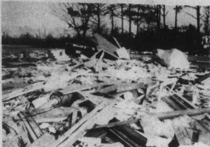
Remains Of Mobile Home