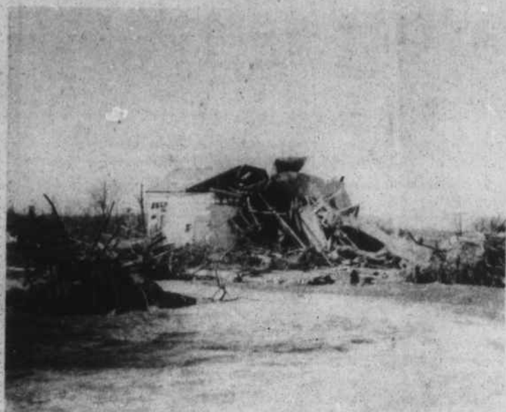
House Destroyed Near North Lenoir High