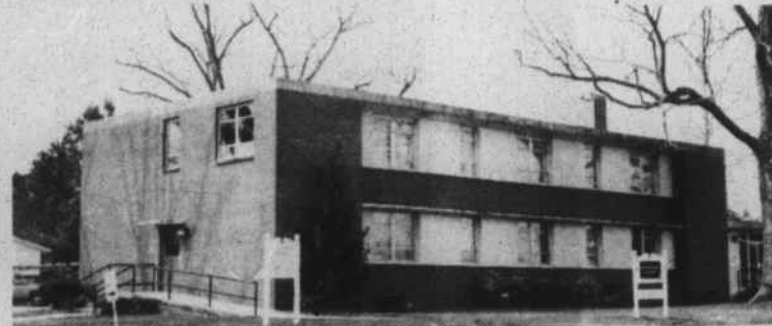
South Wing Annex Offices

The office/clinic building shown above has been the home of the health department since 1954. It is located behind the courthouse and was built the same year as the hospital and the South Wing Annex. The recent addition of a new A-frame roof has changed the outside appearance.