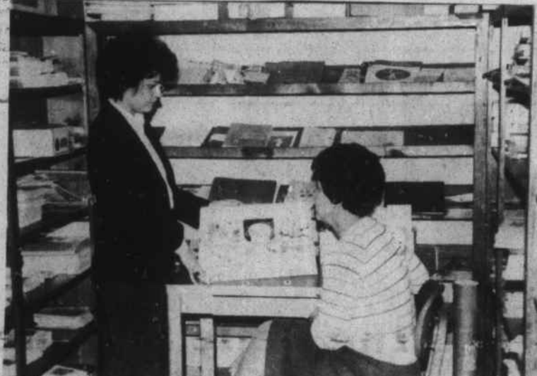
Keeping The Public Informed

The South Wing Annex Offices, formerly used as quarters by the hospital nurses, now houses the Environmental Health staff and the Administrative offices of the health department on the second floor. Recent additions in staff and programs required moving the e above offices from the main building to the South Wing Annex. The Building Inspection department is also located on the second floor.