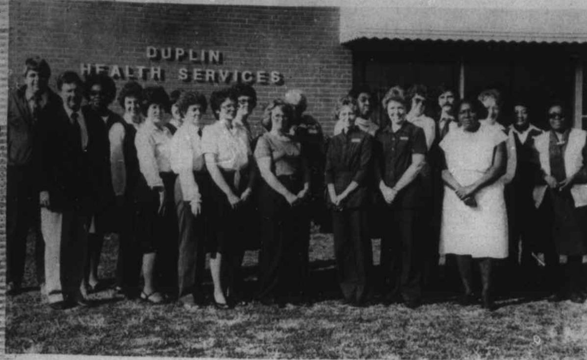
Duplin County Health Services Staff