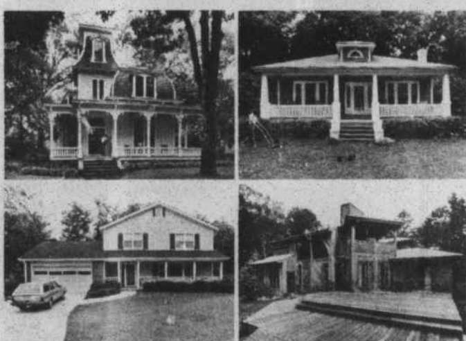
Savings based on houses with 1,500 square feet. Bigger houses save more.

The way you build a home can make up to a 40% difference in what you pay for heating and cooling. Yet some people tend to think an energy-efficient home has to be an exotic plan out of the 21st Century. The fact is, almost any kind of house can be built to what we call "Common Sense" standards. And, even though it does cost a bit more to build, your energy savings of $20 to $30 a month make up the difference in a hurry. What's more, chances are, there are also a lot of ways you can save in the home you're in now. So call us or stop by. Whatever your housing situation, we're happy to help out. Because the more you get out of your energy dollar, the more we get out of ours. And that's better for both of us.